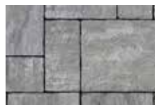
STEEL MOUNTAIN (Random Bundle only)