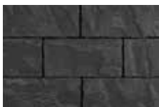
MIDNIGHT CHARCOAL (5 X 10 only)