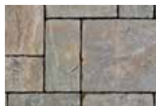
FOSSIL (Random Bundle only)