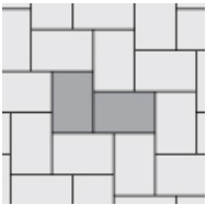
Transition 6x9 HB_D