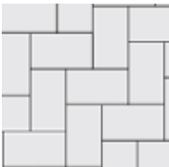
Richcliff LargeRec HB_H