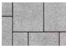
COBALT GREY SPECIAL ORDER