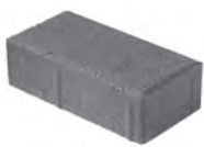
HOLLANDSTONE 4 x 8 x 2 3/8" 100 x 200 x 60 mm