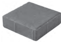
DOUBLE HOLLAND 8 x 8 x 2 3/8" 200 x 200 x 60mm